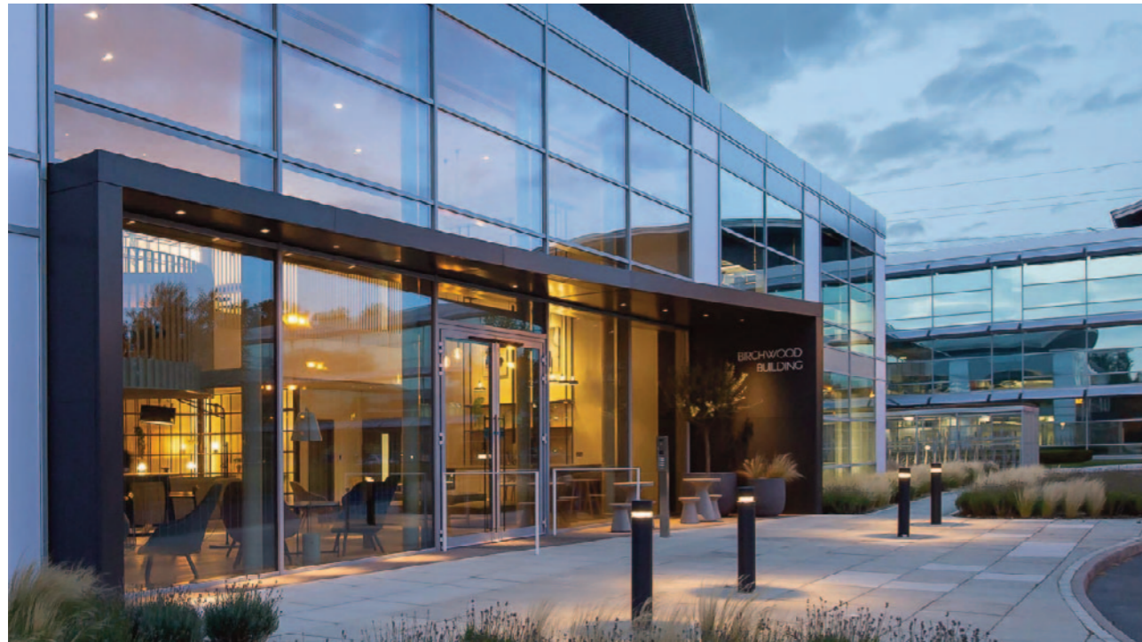
Birchwood Building, Leatherhead

The Birchwood Building is a recently refurbished multi-let office building of 34,939 sq ft (3,246 sq m) together with 154 car parking spaces. It is located within The Leatherhead Park situated on Springfield Drive adjacent to the international headquarters of Unilever and the national headquarters of CGI.